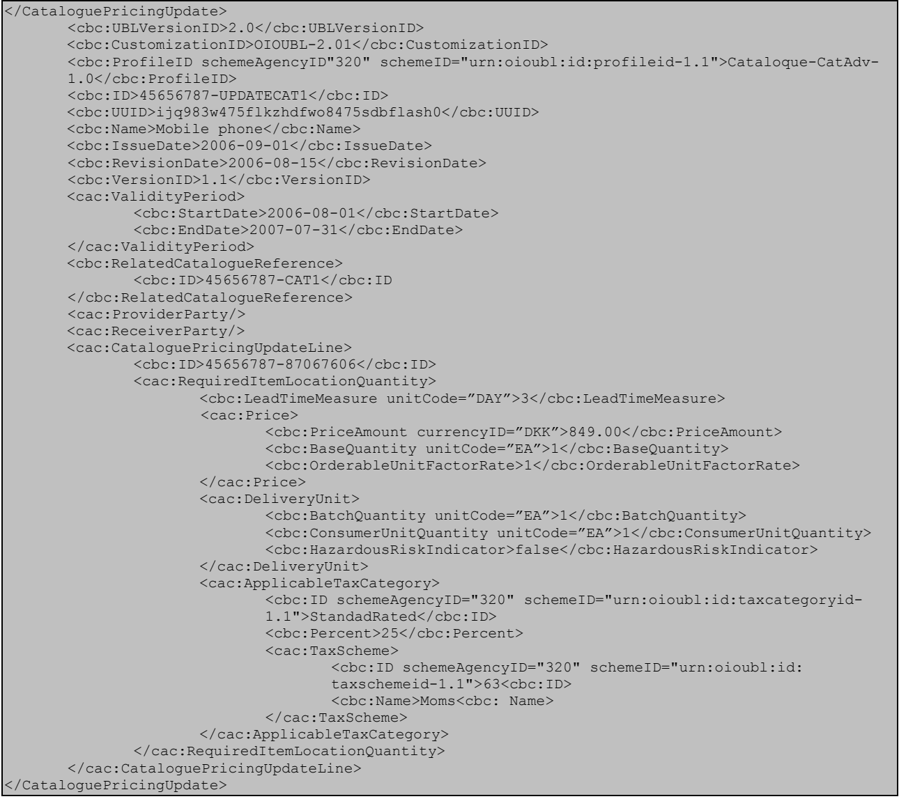
Figure 7: Example of updating a catalogue line with the CataloguePricingUpdate document

The CataloguePricingUpdate document gets its own unique identifier ( ID ) and the Catalogue being updated is specified using the RelatedCatalogueReference/ID .