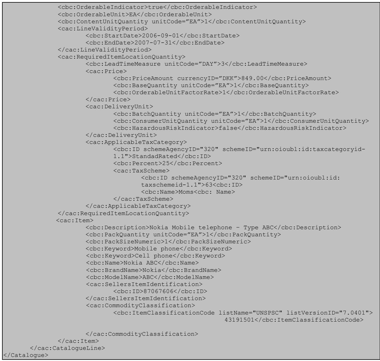
Figure 6: Example of updating a catalogue line with the Catalogue document

The ID identifies that catalogue to be updated.